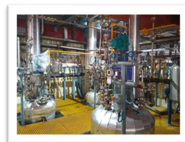
Rallis Dahej Pilot Plant (Interior)

Approved for release on ASX by Bio-Gene Board of Directors.