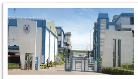
Rallis Dahej SEZ Plant

The Company's business model involves entering into licensing arrangements with commercial partners internationally to formulate and develop insecticidal products that contain Flavocide. Bio-Gene will then be entitled to receive up-front and milestone payments and then royalties from its commercial partners upon sale of these new products. Bio-Gene's business model also includes the supply of Flavocide to these partners in commercial quantities under a commercial supply agreement.