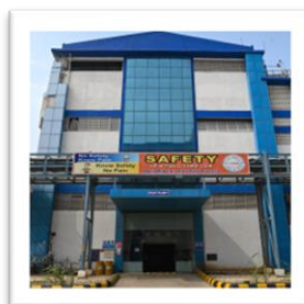
Rallis Dahej Pilot Plant (Exterior)